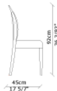
VISTA LATERAL VIEW SIDE