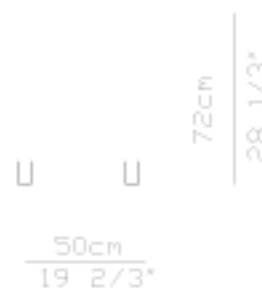
VISTA LATERAL SIDE VIEW